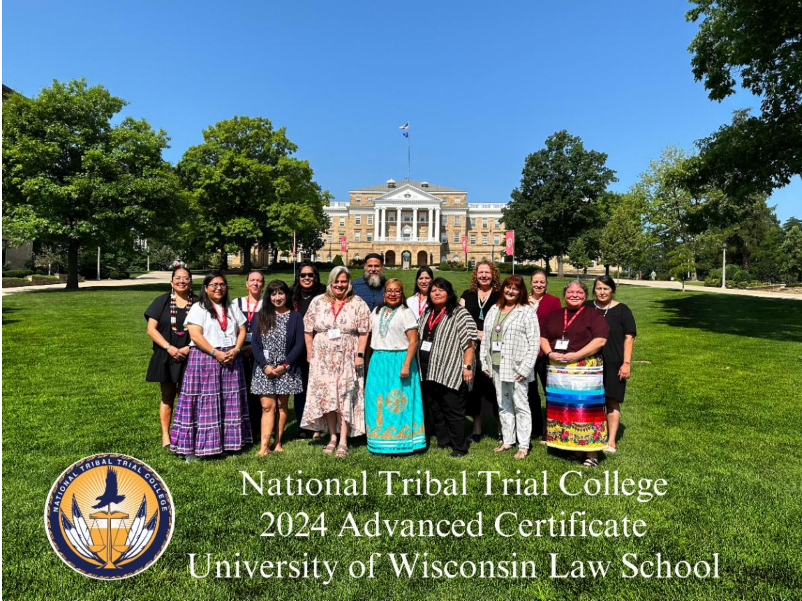
National Tribal Trial College 2024 Advanced Certificate University of Wisconsin Law School